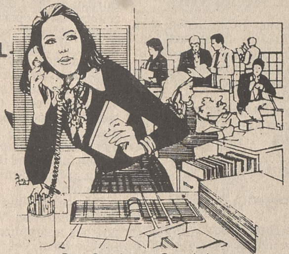
Our Students Get Jobs

160 W. Franklin Boulevard Gastonia, N.C.