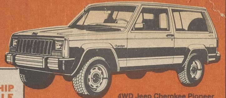
4WD Jeep Cherokee Pioneer

THE ONLY JEEP & RENAULT DEALERSHIP BETWEEN CHARLOTTE AND GREENVILLE