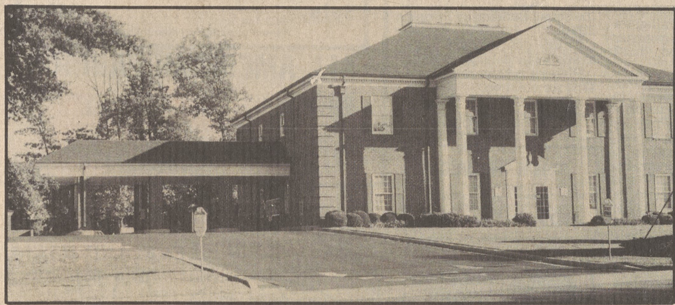
OUR NEW DRIVE IN WINDOW ADDITIONS 700 WEST KING STREET

Over the years, folks around here have come to know Home Federal as a symbol of strength and stability. Your grandparents came to us for their first loan on their first house. Your parents came to Home Federal for a loan to start their new business. And now, we're your bank, the place to go for good advice.