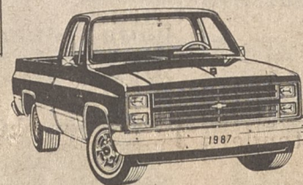
R10 Silverado Fleetside