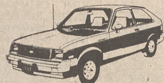
Chevette CS Hatchback Coupe