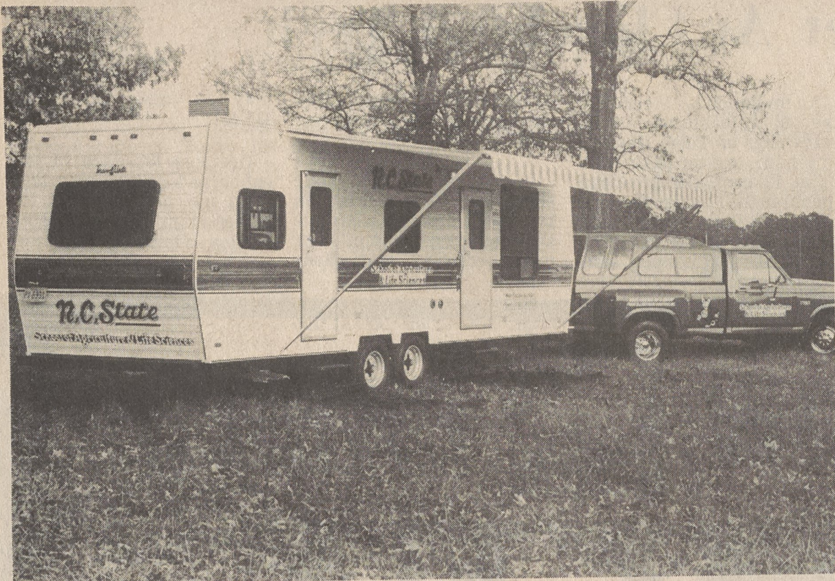
TRAVELING EXHIBIT AT CREST HIGH—A traveling career exhibit from the School of Agriculture and Life Sciences at N.C. State University will be on the campus of Crest Senior High School Wednesday, Jan. 21 to acquaint Cleveland County students with degree options and career opportunities.