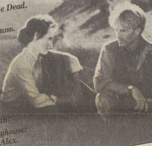
Robert Redford and Meryl Streep in "Out of Africa."

Out of Africa. White Nights. HBO Pictures: The Quick and the Dead. Bruce Willis: The Return of Bruno. FIX. Wildcats. HBO Showcase: Control. The Best of Times. On Location: Bob Goldthwait "Share the Warmth" HBO Family Playhouse: The Truth About Alex. And Much More.