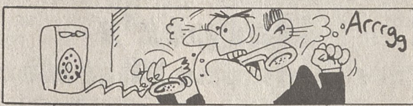
On August 18, 1975, an inn keeper in England, recieved a telephone bill for the equivalent of $4,386,800,000. It was later found that this bill contained "an arithmetical error."