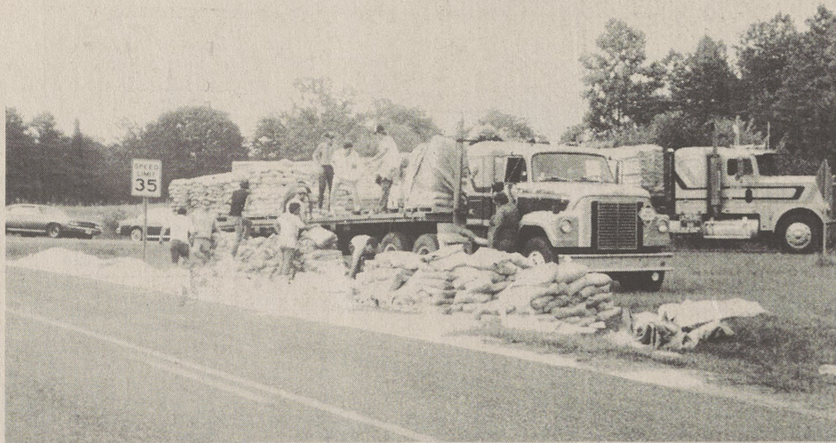
MICA SPILL —Ten volunteer firemen in the Bethlehem Fire Department, above, assist trucker Oreal Tucht of Acme Trucking, Louisiana, in reloading mica after the heavy load spilled all over Dixon Road Tuesday at 5:30 p.m. when an oncoming car traveling on the trucker's side of the road in a curve near Compact School forced the trucker to brake and shift his load. Firemen worked for two hours to reload the tractor trailer rig, headed south to the I-85 Truck Stop. The driver of the car, traveling north, did not stop. The tractor-trailer rig had loaded mica at KMG Minerals.