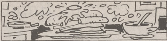
When grating potatoes for pancakes, add a little sour cream to prevent them from discoloring.

A special performance will be given Wed., Nov. 4 for school children from the Cleveland County and Shelby City schools. Now in its 11th year, this student day at the opera is designed to introduce students and their parents to the medium of opera.