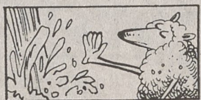
Sheep will not drink from running water.