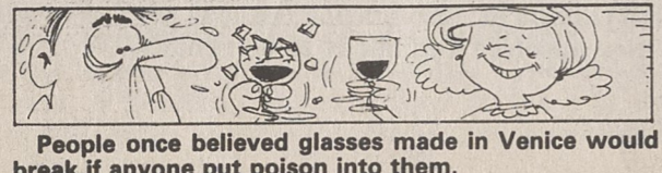
People once believed glasses made in Venice would break if anyone put poison into them.