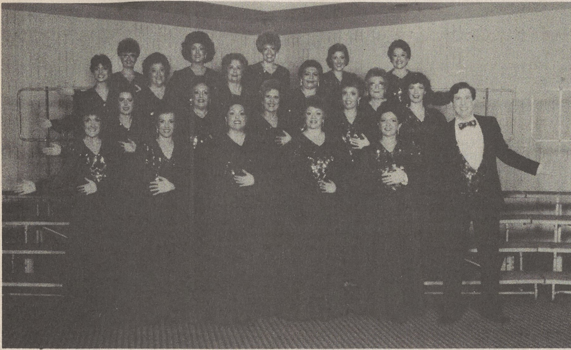
SWEET ADELINES - Pictured are members of Sweet Adelines Greater Gaston Chapter who are looking for members from the Greater Kings Mountain area.