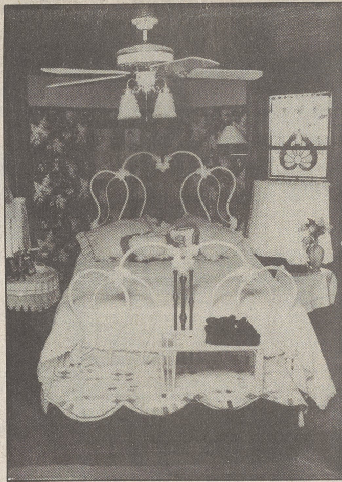
BEDROOM OF THE HOME SETS THE THEME FOR THE MOTIF OF THE CHAPPELL HOME