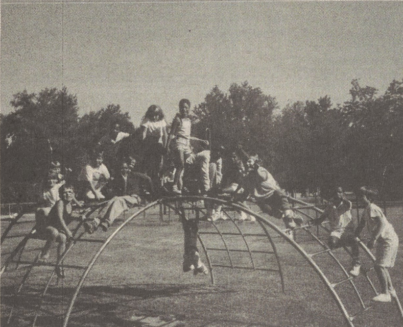
SUMMER SCHOOL CAN BE FUN , as these students point out, as well as a learning experience.