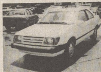
1985 FORD TEMPO Automatic, air, AM/FM stereo, 36,000 actual miles. New tires. $5495