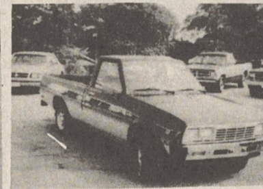
1986 DODGE RAM 50 Air, 5-speed, new tires, road wheels. $4995