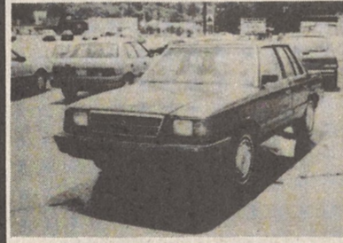
1987 DODGE ARIES Special purchase. Transferable 7/70 warranty. Special financing available. Two to choose from. $7695