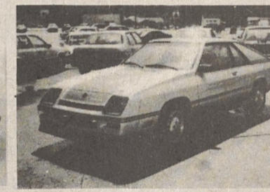
1984 DODGE SHELBY CHARGER Sunroof, new tires, 5-speed. $4995

Special Purchase 1988 DODGE 600 Air, Tilt, Cruise - 7.8 APR $9795