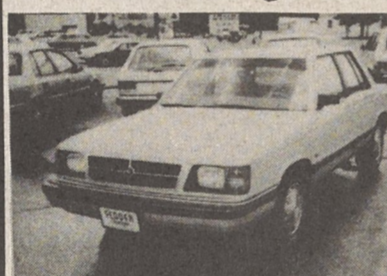
1985 DODGE ARIES Clean, locally owned, low mileage. AM/FM stereo, automatic, air conditioning. $5495