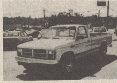
1987 DODGE DAKOTA New tires, road wheels, 5-speed for extra power. AM/FM stereo. Transferable 7/70 warranty. $7795