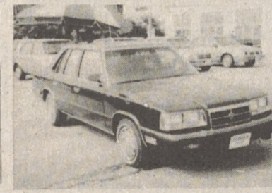
1988 DODGE 600SE Full power, loaded, 7/70 warranty. Special financing. $10,495