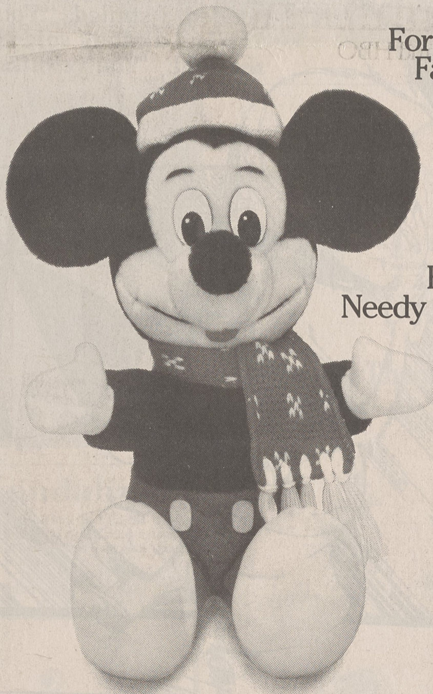
Alternate plush toy may be substituted.