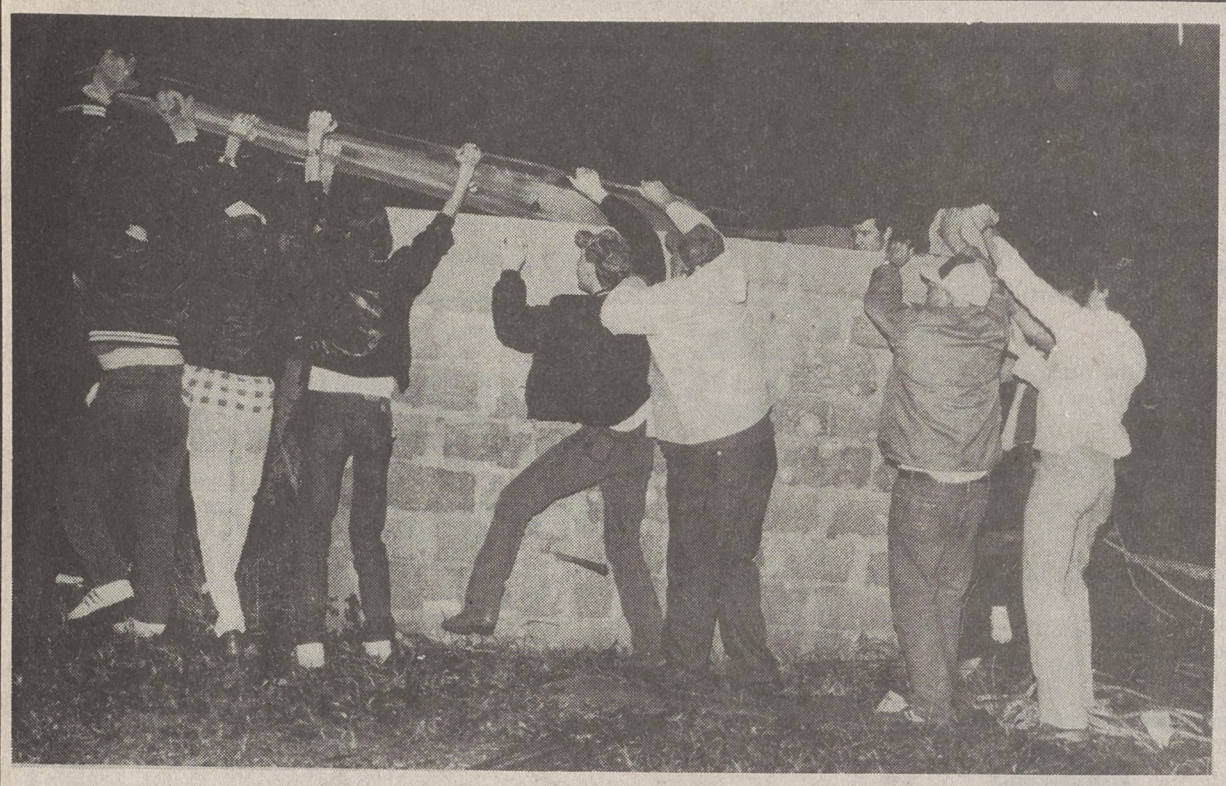
Rescuers Remove Top From Well...