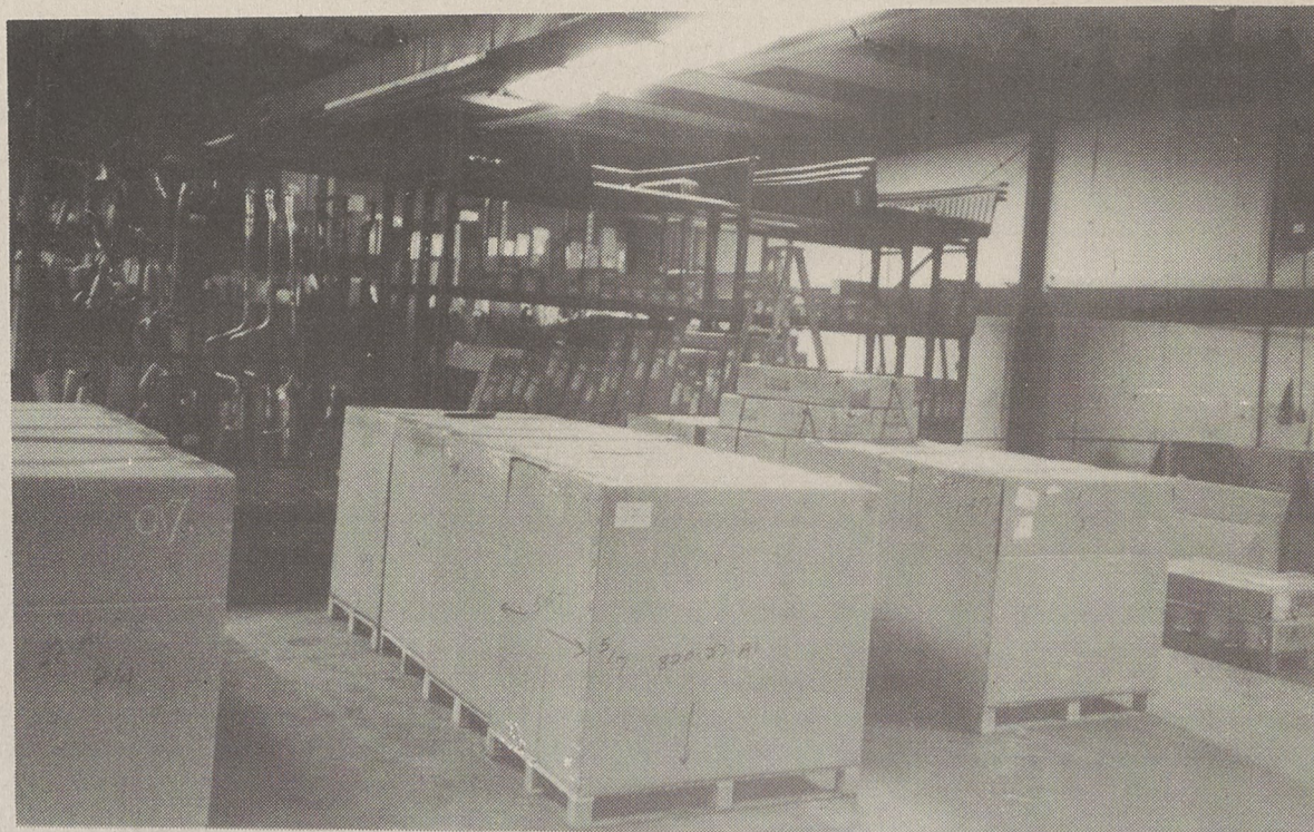
MOORE'S TOYOTA EXPANDS - Moore's Toyota has expanded its parts department, offering a full line of parts for the do-it-yourself customer. The dealership is carrying a full line of parts for Toyota new and used cars and trucks and in the future will stock all parts for all types of import cars.