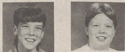
BY LANCE WALLACE and CHAD SMITH

The Institute of Government offers a similar program for principals.