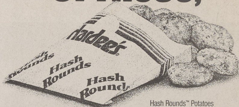
Hash Rounds™ Potatoes