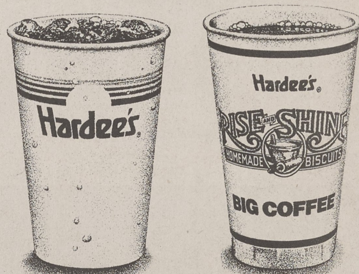
Medium Soft Drink