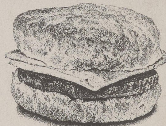
Sausage & Egg Biscuit