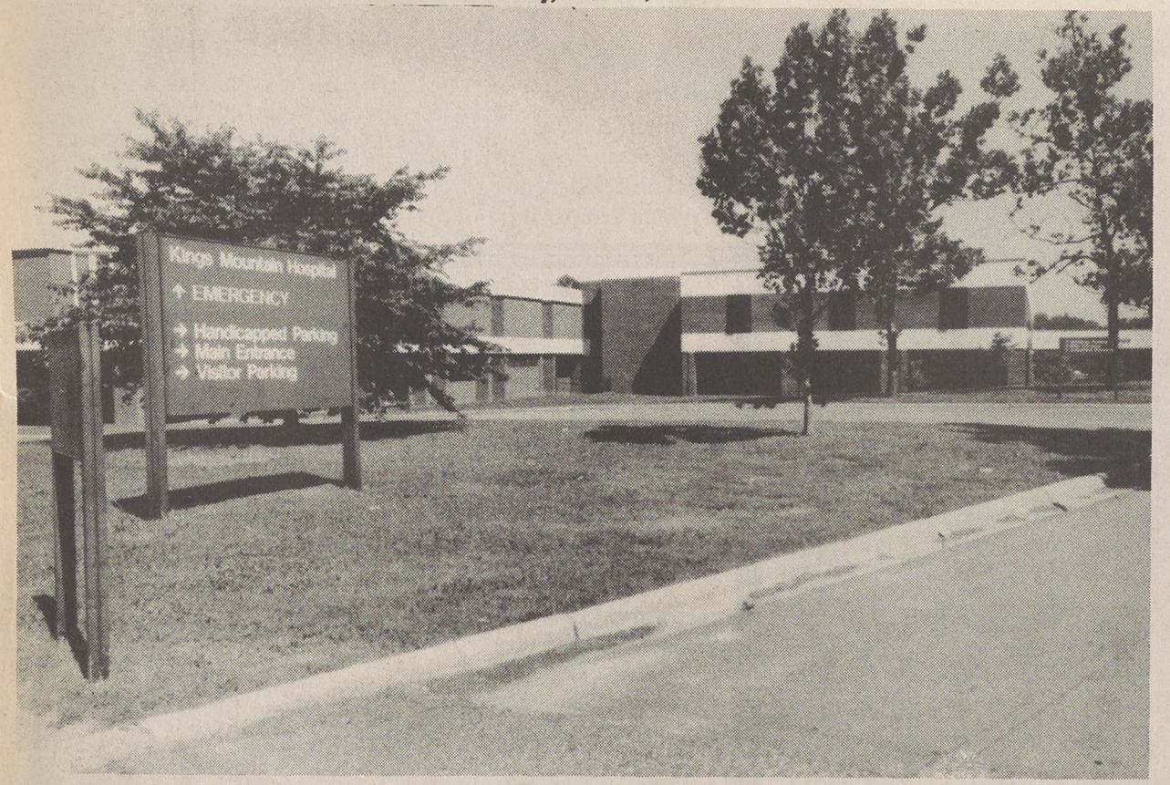
ACCREDITED - Kings Mountain Hospital has been awarded continuing accreditation by the joint Commission on Accreditation of Health Care Organizations. The commission's on-site survey at the hospital was held in January.