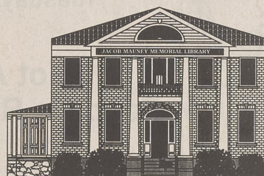
JACOB S. MAUNEY LIBRARY

.....Replicas of special sites throughout Kings Mountain