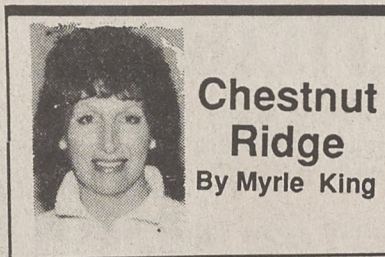
Chestnut Ridge

A terminally-ill child has asked the Children's Wish Foundation for get-well cards to help him get in the Guinness Book of Records for having the most get well cards.