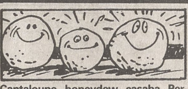
Cantaloupe, honeydew, casaba, Persian and Odessa are all varieties of the muskmelon. Their differences are the result of cultivation in different regions of the world.

An informative report about wine as well as the industry's economic contribution to the economy is available free by writing to: National Wine Coalition, Dept. NAPS, 1825 I Street, N.W. Washington, D.C. 20006.