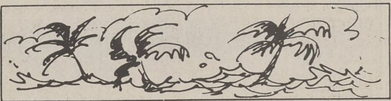
The tidal wave caused by the eruption of a volcano on the island of Krakatau in 1883 reached as far as England.