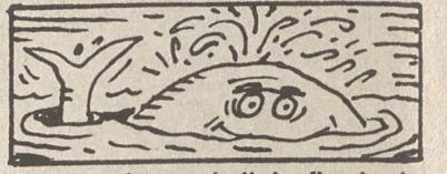
Because its eyeball is fixed, the whale must move its huge body to shift its line of sight.