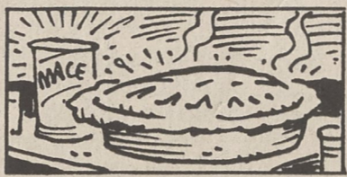
The highly flavored spice known as mace is actually the covering of the nutmeg. It is usually sold ground and is often used to flavor fruit pies.