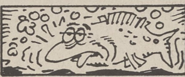
Fish can be susceptible to seasickness.