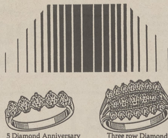
5 Diamond Anniversary

any cooler temperatures the rest of the week. With the enormous strain on the city's two electrical sub-stations, power outages won't go away but citizens can cut back on the load by conserving electricity on a volunteer basis. "The city is trying to do everything to fix what is mechanically wrong but we need to start making volunteer energy conservation measures as far as use of electricity is concerned," said Wood.