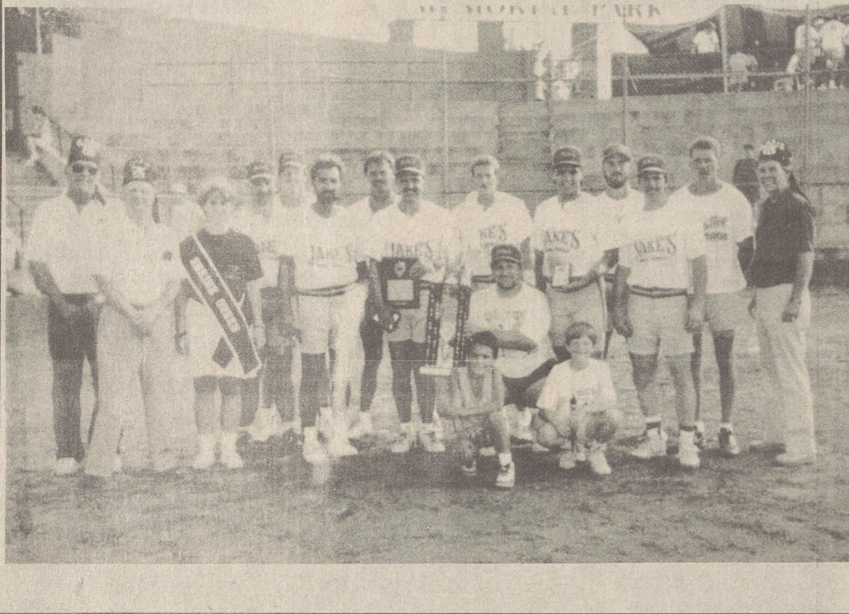
The eighth annual White Plains Shrine Club Softball Tournament was played last Saturday and Sunday at Jake Early and Davidson Parks in Kings Mountain.

Fourteen teams entered the tournament and Jake's of Gastonia won the championship. Second place went to Fletcher's of Belmont and third was Roxy of Kings Mountain.