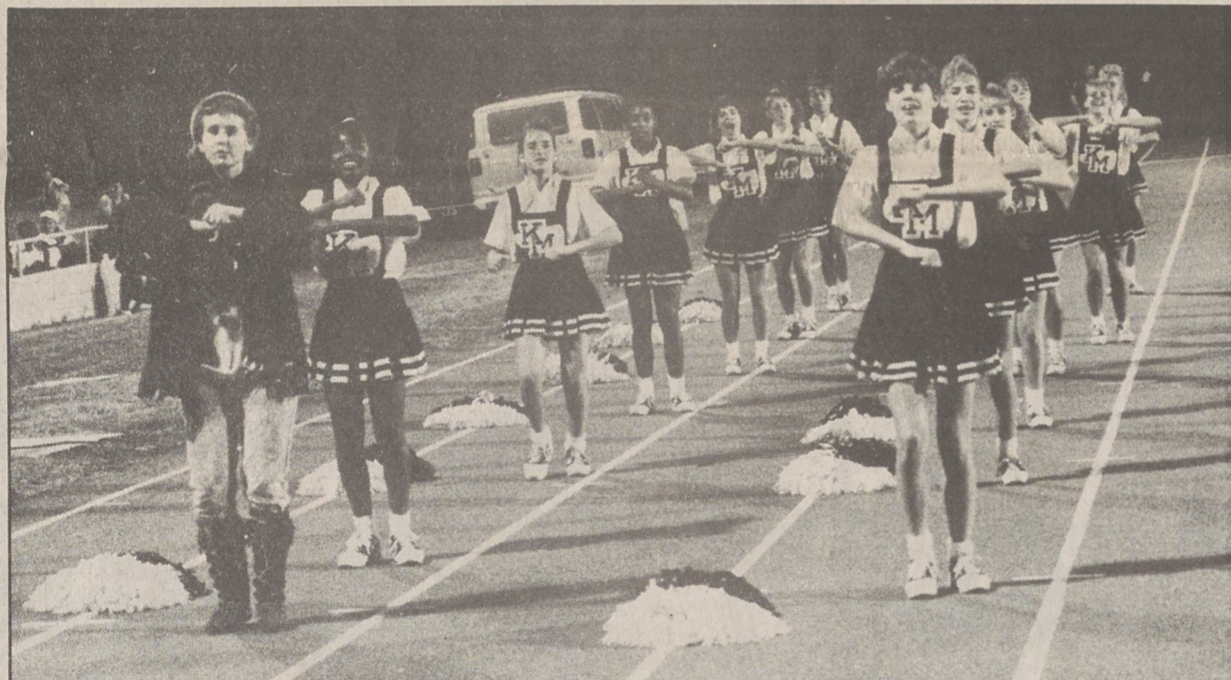
GETTING THE SPIRIT - Kings Mountain High's cheerleaders have a big time cheering the Mountaineers on to victory in last week's 6-0 win at Bessemer City.