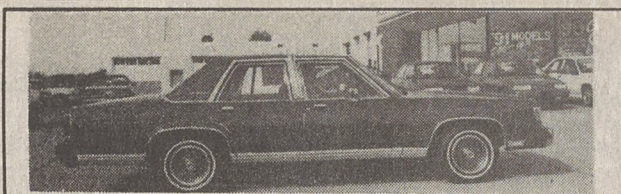
1990 FORD CROWN VICTORIA LX

5.4 liter, V-8, automatic transmission, air cond., power windows & locks, 6 way power drivers seat, tilt and cruise, AM/FM stereo cassette, dual electric mirrors, rear window defroster, cast alum. wheels, drivers side air bag, local trade, only 10,000 miles. Stock UC4027