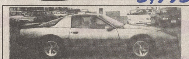
1988 FIREBIRD FORMULA

5.0 liter V-8, automatic overdrive transmission, air conditioning, tilt & cruise, AM/FM stereo cassette, T-tops, alum. sport wheels. Only 30,600 miles. Stock UC3912