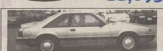
1990 FORD MUSTANG, Hatchback LX

4 cyl. engine, 5 speed manual trans., power windows and locks, cruise control, rear window defroster, dual electric mirrors, drivers side air bag. Only 5,600 miles. Stock UC4016.