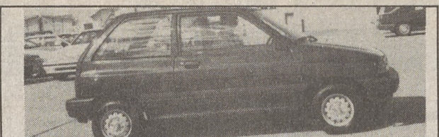
1989 FORD FESTIVA

4 cyl. engine, 4 speed manual trans., great economical transportation. Local one owner trade. Only 25,000 miles. Stock UC4030