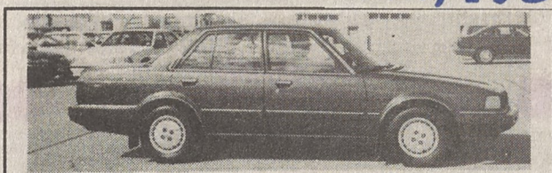
1985 HONDA ACCORD LX

4 cyl. engine, automatic overdrive trans., air cond., cruise control, power windows & locks, AM/FM stereo cassette, rear window defroster. Local one owner trade. Stock UC4014