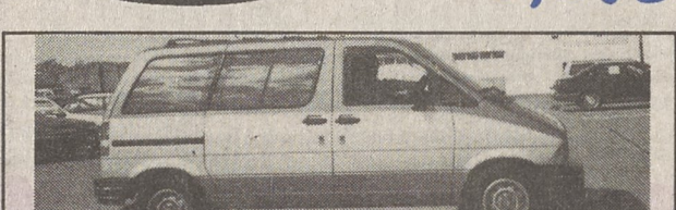
1988 FORD AEROSTAR XLT 7 PASS.

3.0 liter, V-6 engine, automatic overdrive trans., air cond., tilt & cruise, power windows & locks, AM/FM stereo cassette, rear window wiper/washer & defroster, luggage, deluxe 2 tone paint. Local one owner trade. Stock UT2910.