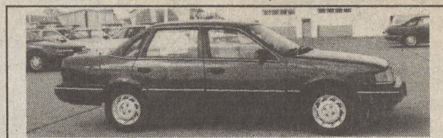
1991 FORD TEMPO GL

4 cyl. engine, auto trans., air cond., power windows & locks, tilt & cruise, AM/FM stereo cassette, rear window defroster, dual elec. mirrors, poly cast wheels. A special purchase of Ford program cars. 2 to choose from at this great price.