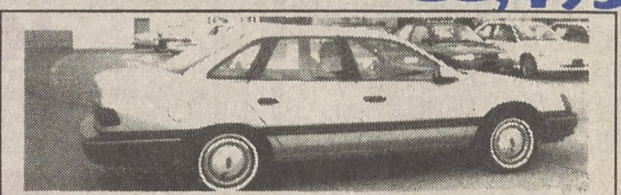
1990 FORD TAURUS

3.0 liter V-6 engine, automatic overdrive transmission, tilt & cruise, AM/FM stereo, dual electric mirrors, rear window defroster, driver side air bag. Was a Cleveland county drivers education car. Stock UC3942