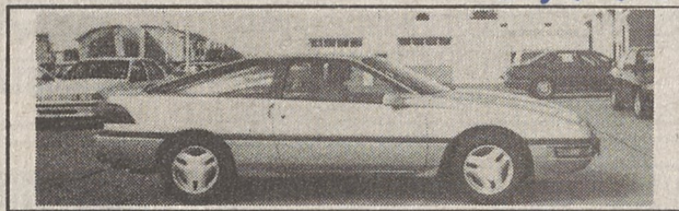
1990 FORD PROBE LX

3.0 liter, V-6 engine, auto overdrive transmission, air cond., tilt & cruise, power windows & locks, 6 way power drivers seat, AM/FM stereo cassette, electric dash & trip computer, rear window wiper/washer, defroster, dual elec. mirrors, cast alum. wheels. Local one owner trade. Only 24,500 miles. Stock UC4022