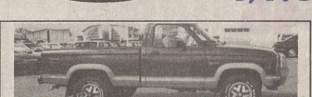
1988 FORD RANGER XLT 4X4

Short bed, 2.9 liter, V-6 engine, 5 speed manual trans., air cond., AM/FM stereo cassette, sliding rear window, cast alum. wheels. Stock UT2908.