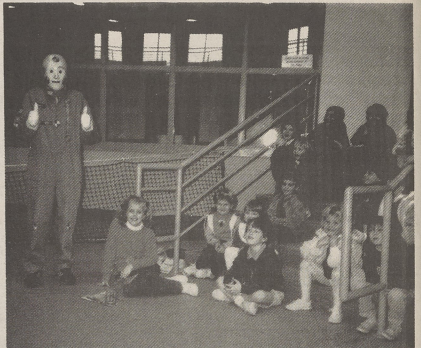
HEAD START HEALTH FAIR- A seatbelt dummy entertained kids attending the Cleveland County Head Start Health Fair recently but he's no dummy when he gives them information about the importance of buckling up to save lives.