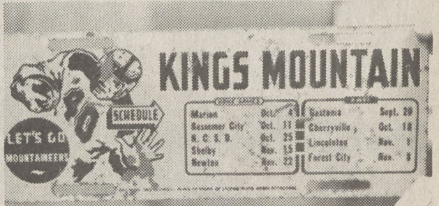
David Clippard's 1940 KMHS football schedule/car tag, purchased for one dollar at a flea market.

He came to the Herald and found that the 1940 schedule in the paper matched the schedule on the car tag.