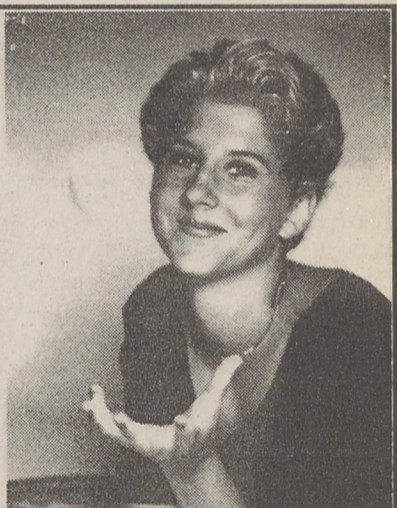
Top-Ranked Tennis Star Monica Seles

Plus with every full-size Matrix purchase, get instant Scratch-Off Cards good for FREE Matrix Hair Care products.