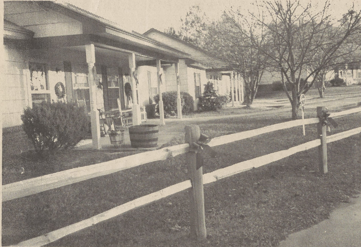
The Battleforest Apartment complex in East Kings Mountain is beautifully decorated for the holidays. Red bows and holly, wreaths and Santa Claus arrangements decorate apartments, yards and porches.