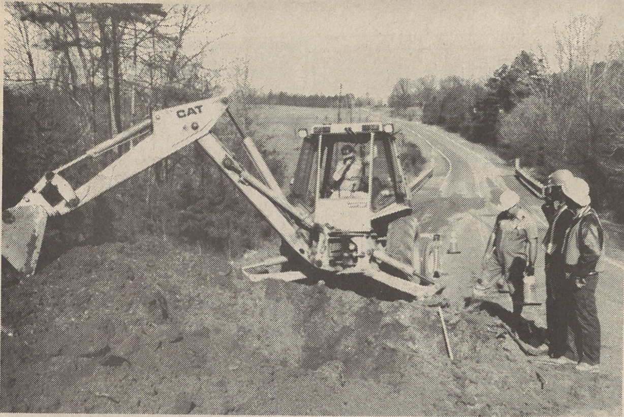
FIXING WATER LINE - City employees repaired four breaks in a 20-inch water line on Crocker Road Monday and Tuesday. Hydrant flushing the rest of the week will eliminate the taste of rusty pipes, said City Engineer Tom Howard, who said city's hindsight in spending $12,000 last year to loop the system with a line down Phifer Road kept industries on Grover Road fully operational.