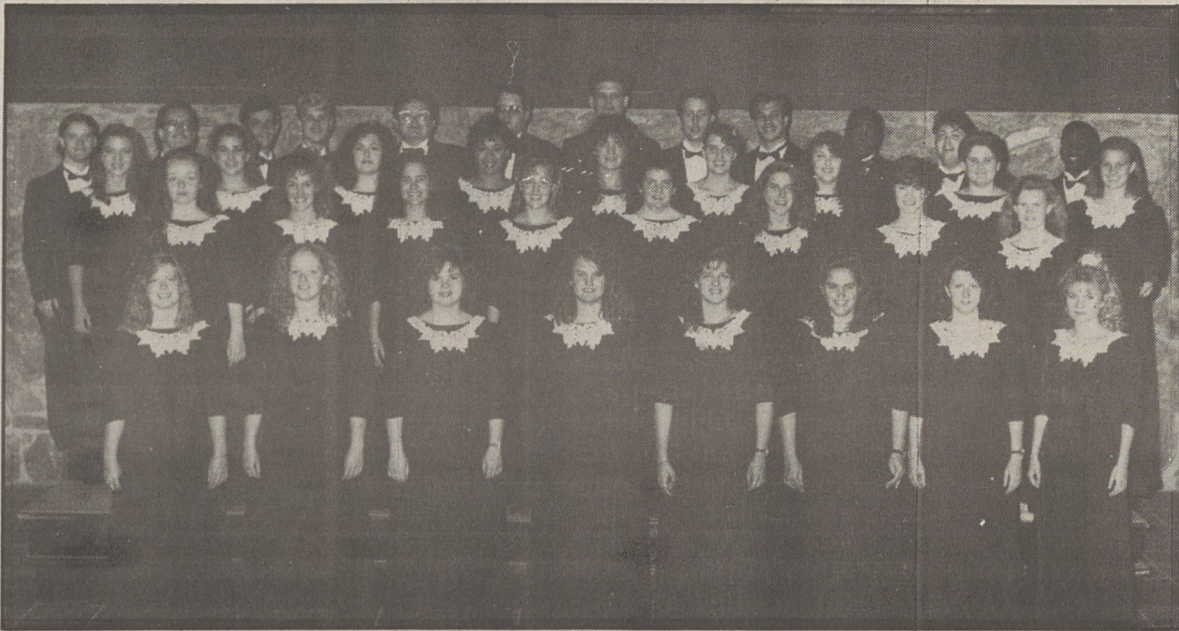
TO APPEAR IN BELMONT - Here is the Mars Hill College Choir, who will be in concert at the First Baptist Church, Belmont, on Sunday, Feb. 23, at 7 p.m. The audition choir is made up of 43 members, both music majors and non-music members. The Feb. 23 performance is free and open to the public.