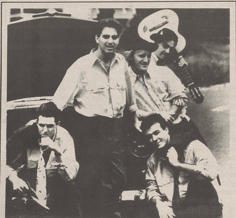
The Newsboys of Australia are fast becoming this nation's hottest Christian band. They will appear at the Kings Mountain Baptist Association's "Rescue '92" youth crusade April 2-4.