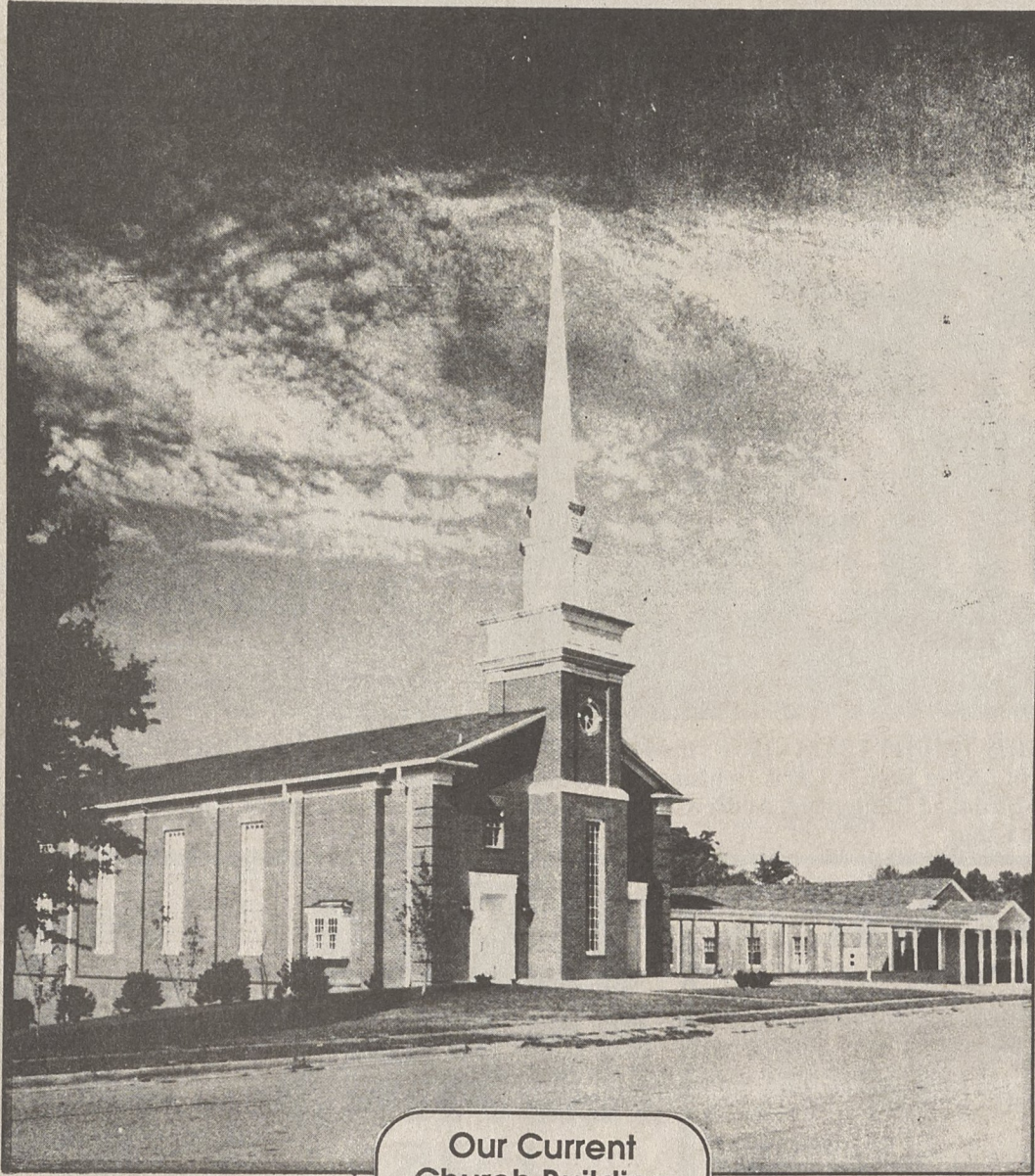
Our Current Church Building