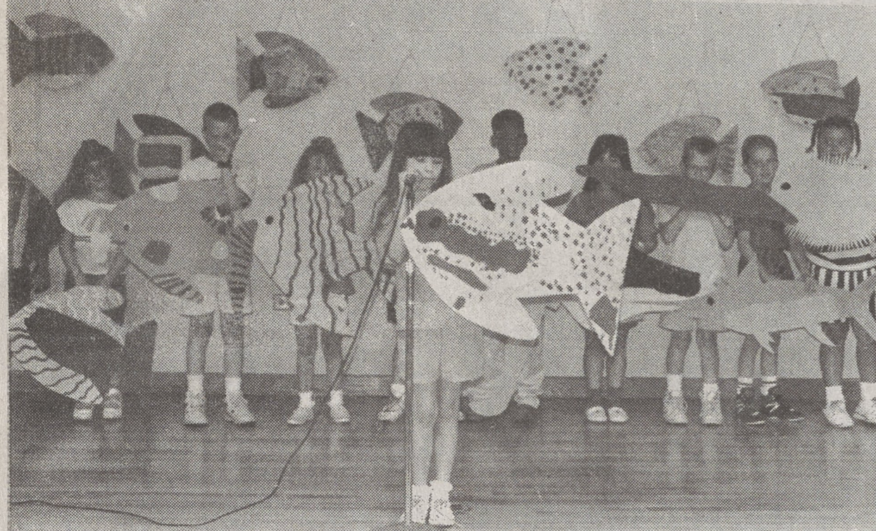
Second graders at East Elementary put on a show for parents to display what they learned while studying about all kinds of fish and sea animals.

SCHOOL IS DEDICATED TO WORKING WITH CHILDREN, PARENTS, AND COMMUNITY TO INSURE THAT ALL CHILDREN LEARN.