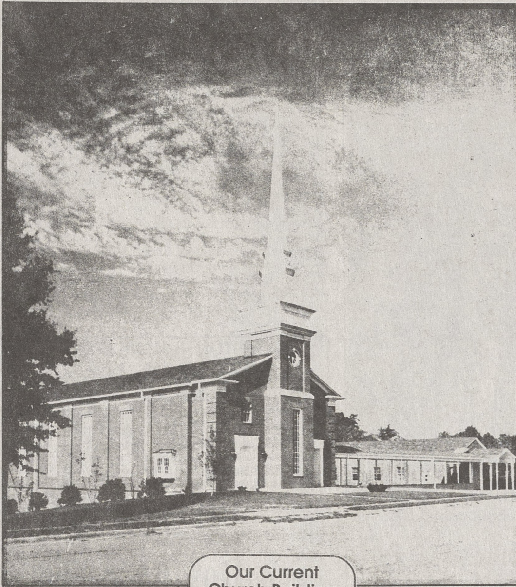
Our Current Church Building