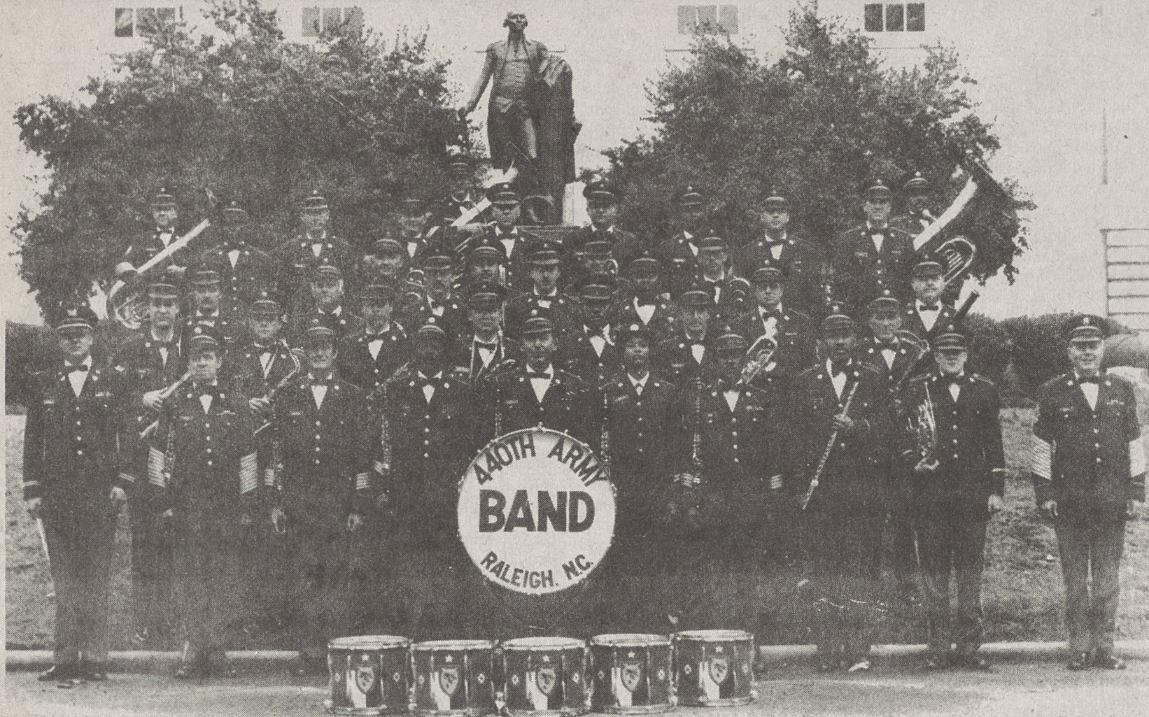
The 440th Army Band, North Carolina National Guard, will present a concert Sunday at 7 p.m. at Kings Mountain National Military Park Amphitheatre. The concert, free and open to the pub-

Investigators have the description of a vehicle possibly involved in the break-in. No arrests have been made.