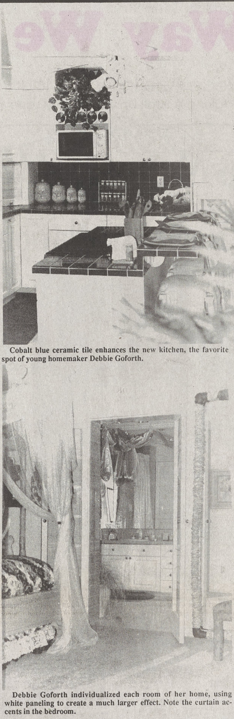
Cobalt blue ceramic tile enhances the new kitchen, the favorite spot of young homemaker Debbie Goforth.