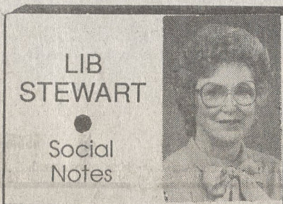
LIB STEWART Social Notes

The form - A form for submitting wedding information is available from the receptionist at the front office. Any information not clearly stated or illegible will be omitted. The newspaper reserves the right not to publish any or all information. A telephone number must be included with the information so that any details may be checked.