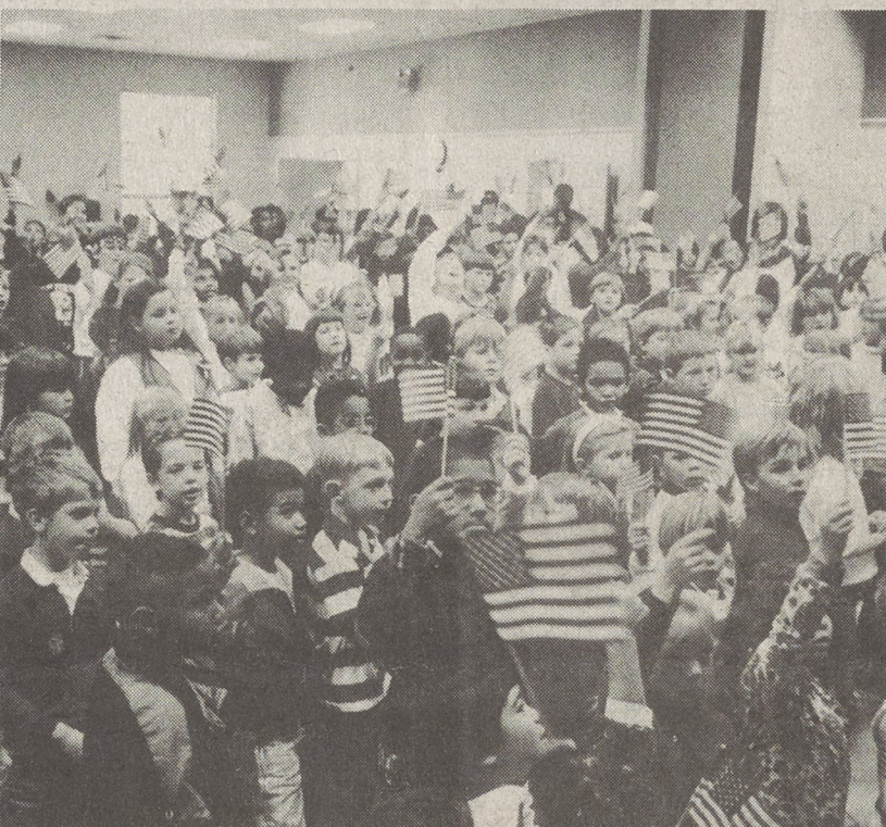
RED, WHITE AND BLUE DAY - East School students sang praises about their country at the school's annual Red, White and Blue Day. The program featured singing by each grade and whole school performances of patriotic songs. Mrs. Judy Whisnant led the program.