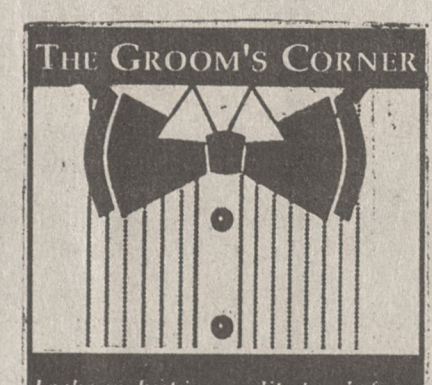
The Groom's Corner!

In lieu of flowers, memorials may be made to Myers Park United Methodist Church Library, Box 6161, Charlotte, 28207.