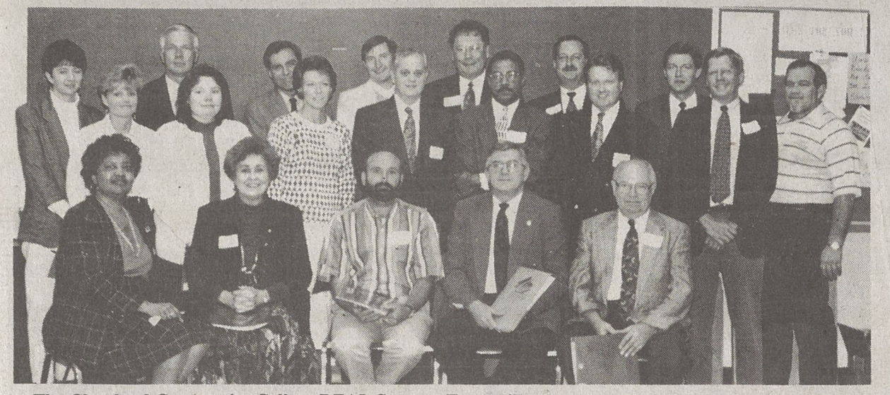
Page-12B-THE KINGS MOUNTAIN HERALD-Thursday, November 25, 1993

The Cleveland Community College REAL Support Team will serve as mentors to students in the REAL Enterprises Program for potential business owners.