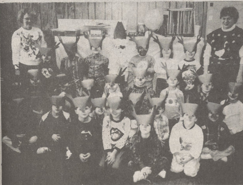
Santa and his reindeer went Christmas caroling at Countrytime Rest Home and presented handmade gifts to residents. These reindeer are kindergarten students at East School.