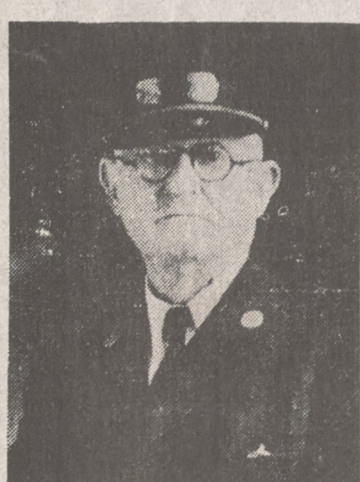
the band party and made arrangements for the stay in Florida.