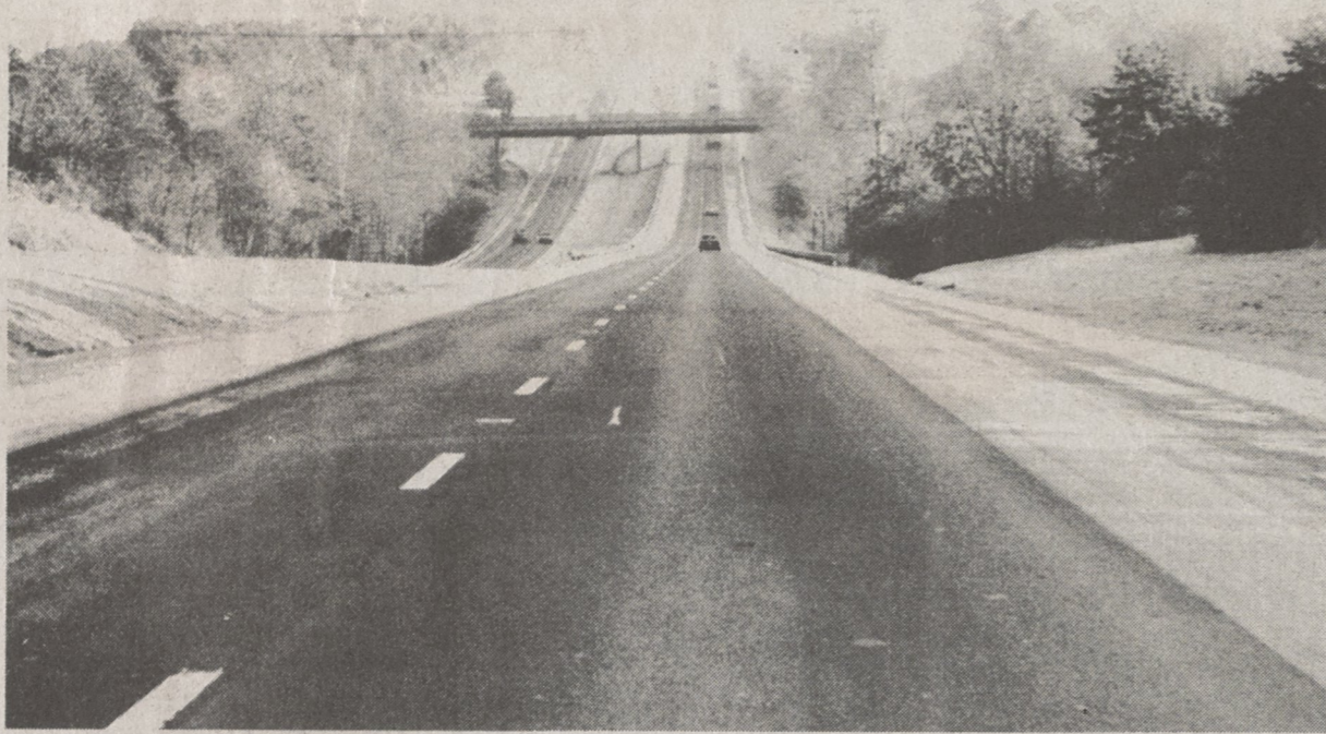
Traffic on I-85 returned to normal Tuesday morning, but the shoulders and median still showed a trace of Monday's ice storm. I-85 travelers on Monday afternoon were moving at tortoise speed, if at all.